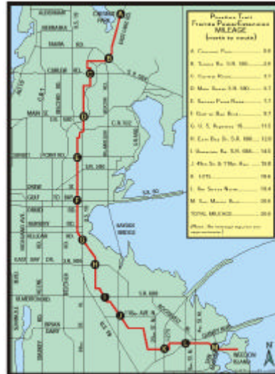
Progress Energy Trail

The Progress Energy Trail will complement the Pinellas Trail because it will be located on the east side of Pinellas County. Although most of the trail is yet to be constructed, a small segment (.2