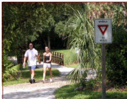
Clearwater East-West Trail-Cliff Stephens Park

The Clearwater East-West Trail is presently a 4 mile