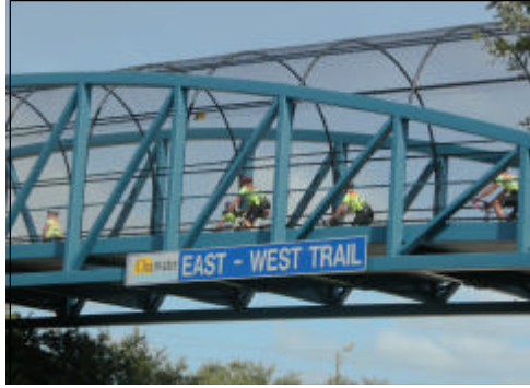
McMullen Booth Overpass

The Druid Trail, a subsection of the East-West Trail, will consist of a four-mile route along the Druid Road right-of-way. It will connect the future Progress Energy Trail and the existing Pinellas Trail. This section connects residential areas, Clearwater High School and new Glen Oaks Park. It will also offer alternative access to retail along Gulf-to-Bay Boulevard. The first phase of engineering and design began in August 2004 and is expected to be finished by the end of 2006. Construction is anticipated to