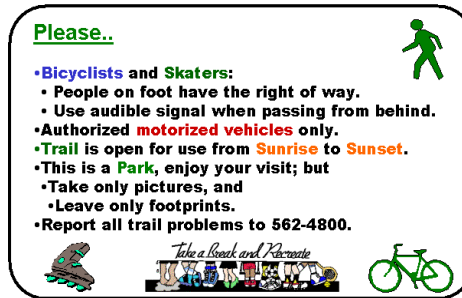
Trail Rules Sign

multiple use trail facility that connects the Long Center to Safety Harbor (see the maps on the following pages). The Clearwater East-West Trail provides an invaluable linear corridor for non-motorized users and it connects various recreational, commercial, and educational destinations. These destinations include the Long Center, Bright House Networks Field, Cliff Stevens Park, Eddie C. Moore Softball Complex, Del Oro Park, Cooper's Bayou Park,