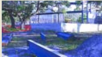
The Ross Norton Recreation Center and Extreme Sports Park is well underway.