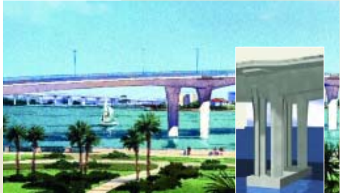
The Florida Department of Transportation has approved a twin-pier replacement for the cracked piers

Work began this September to restore the Alligator Creek floodplain east of Cliff Stephens Park. An integrated park and water management facility will be constructed, where a blighted mobile home park once stood. The project includes a dam on the channel north of Glen Oak Avenue, 26 acres of restored wetlands, trails, boardwalks, bridges and a small parking facility. It also includes the relocation of a sanitary sewer and water transmission main, flood improvements upstream and extends the East-West Trail and Park System. The project should be finished September 2005 at a cost of $22.851 million, which includes buying the property, relocation of mobile home residents, and construction. Another stormwater improvement project at the former Glen Oaks Golf Course is scheduled to begin in 2005.