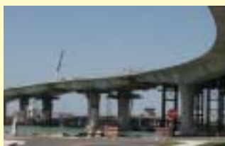
The Memorial Causeway Bridge is now one continuous structure. Plans are underway for a September 2005 opening.

The new Memorial Causeway Bridge is scheduled to open for traffic this September. The twin piers being built around the existing center piers are 70 percent complete, all of the gaps in the superstructure have been aligned and connected, and the old fishing pier is scheduled to be demolished in May. The contractor finished the installation of the pedestrian helix handrail and the interior lighting for the bridge is being installed. The night-lights under the bridge approaches on both sides are installed and operational. The work is complete on the final alignment of Pierce Street under the bridge and the Pierce Street curb and sidewalk concrete work are complete as well. The final coat of the class V finish is being applied. The City of Clearwater is working closely with the Department of Transportation to ensure that the bridge is completed in a safe and timely manner.