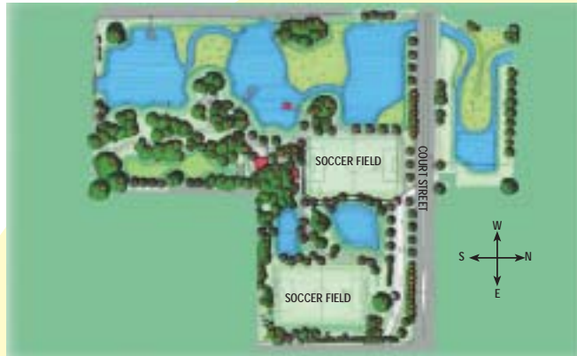
The Glen Oaks Park Stormwater Management Project will serve the dual purposes of both stormwater management and recreation. Two lighted, regulation-sized soccer fields, a trailhead, bicycle trails, restrooms, observation docks, and a gazebo will all add to the park's amenities.

As we look ahead to the future, Clearwater's forecast is exciting. Change is all around as new projects take shape. Construction projects are on schedule and all of us can find satisfaction in knowing we have helped make Clearwater a great place to live, work and play. We are paving the way to improve our city as we move progressively forward to a brighter future together.