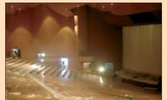
Ruth Eckerd Hall's renovations include improved sound and lighting systems, new seats and a Grand Concourse.

Construction continues on the 90,000-square-foot Main Library located on the bluff overlooking Clearwater Harbor. As the interior framing progresses and roof installation begins, the structure's distinctive roofline and expansive west façade of multi-story glass begin to take shape. The dramatic grand stairway has been installed within a four-story atrium and masonry work on the rooftop terrace has been completed. The new library, designed by world-renowned architect Robert A.M. Stern, will include a local history center, café, computer lab, teen room, gallery space, expanded reading areas and a children's library with a special story-time room.