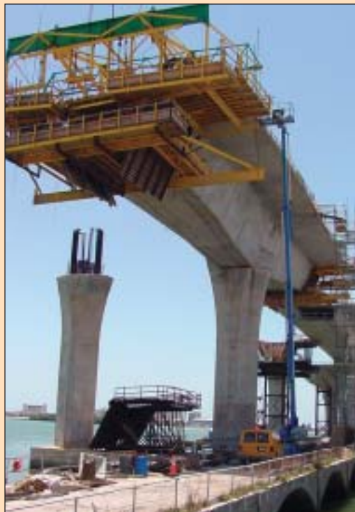
This view of the east approach shows that bridge construction is more than half completed.

Approximately 50 percent of the foundation has been poured, and will be completed in July. Next, work will begin around home plate and the first base dugout. The Complex, which will serve as the spring training home of the Philadelphia Phillies and many local youth and adult baseball activities, will accommodate approximately 8,000 fans. Amenities include an expanded food court area, a grass seating area, suites, and a children's play area. The new complex's location, on U.S. Highway 19 just north of Drew Street, is conveniently located and accessible. It will open for the 2004 spring training season.