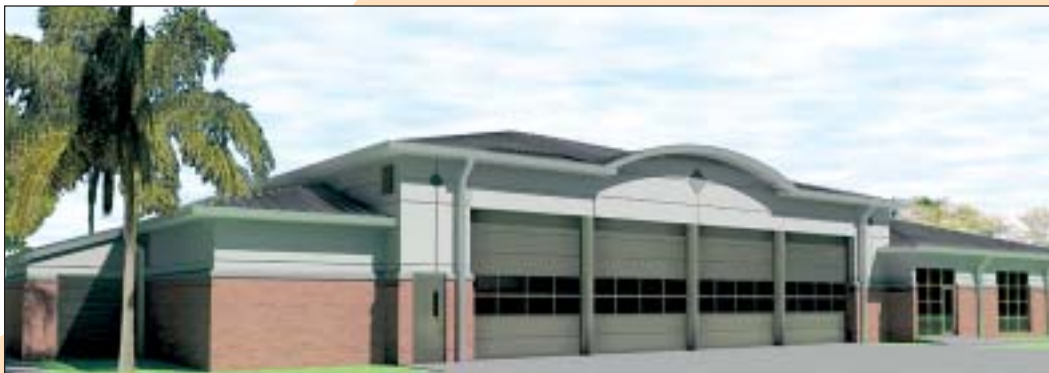
Artist's rendering of the new Clearwater Mall Fire Station 49. The new station will be larger and will have improved amenities.