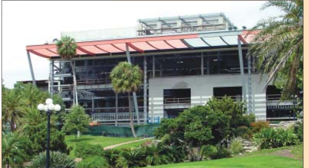
The distinctive roofline of the Main Library is clearly visible from Coachman Park.

Progress continues on various City projects. New construction and redevelopment are changing the face of our City. Residents, businesses and visitors are asked to be patient during these changing times. These projects, which are at various stages of completion, are proof that we are truly partners in building a brighter future together.