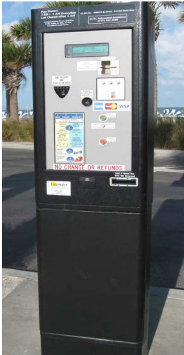
Solar powered Pay Station at Pier 60 on Clearwater Beach.

A Pay & Display pay station is an automated multi-space parking meter. Time receipts are dispensed to be displayed on the dash of the vehicle for enforcement purposes. Payment options include credit cards, bills, and coins for customer convenience.